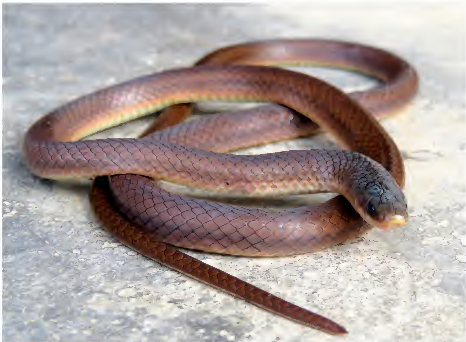
Fig. 1. Liopeltis rappi from Dhodeni, Kabilas, Chitwan.